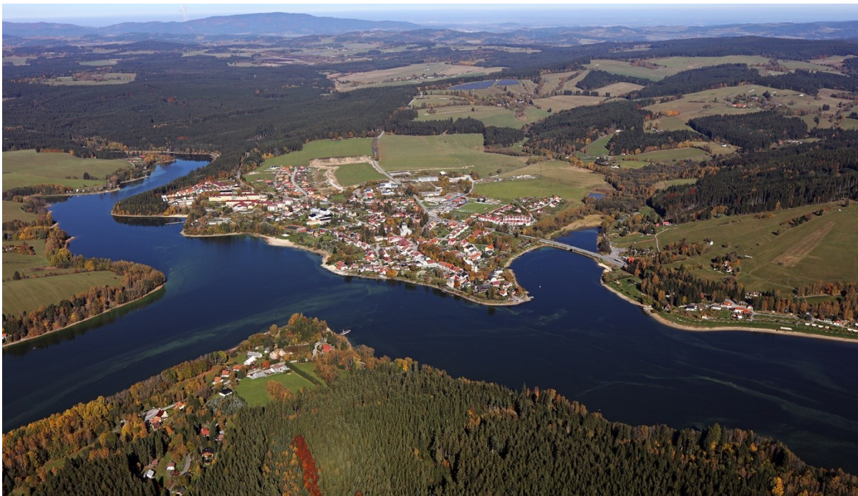
Aerial view of the conference venue, Frymburk, located on the left bank of the Lipno Reservoir.

Please check the conference website www.IAP2025.cz for updates and the latest information.